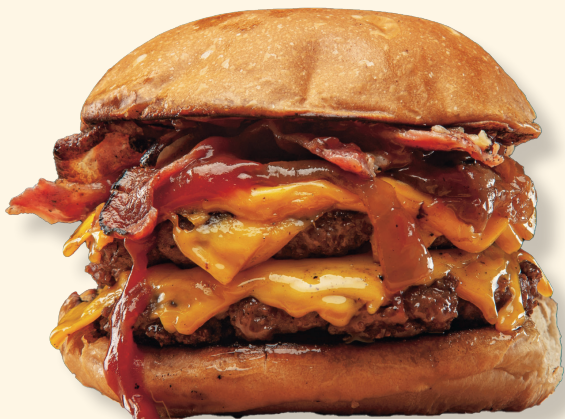
DOUBLE BACON SMASH

2x smashed beef patties, cheddar cheese, smoked bacon, Thunder Secret Sauce on a brioche bun. €19